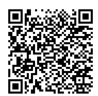
Scan & Register